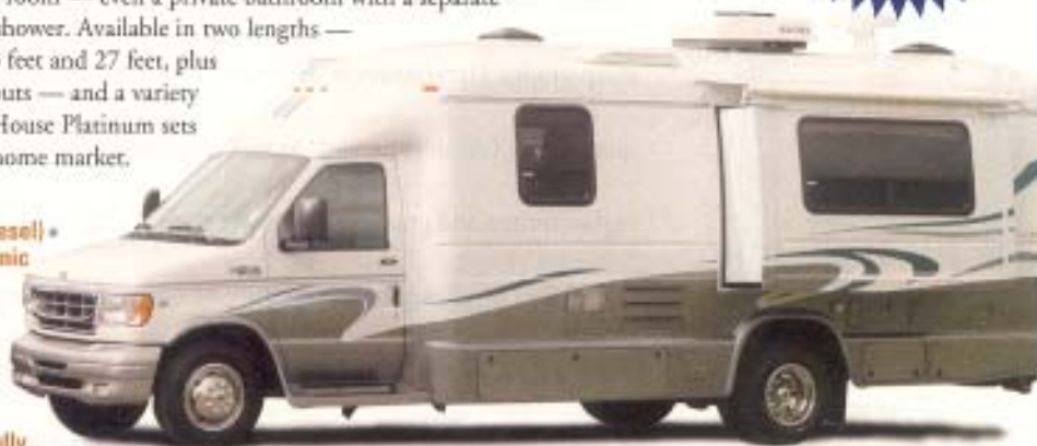
Coach House Platinum™ 270XL

Heavy-duty Ford E-450 chassis (gas or diesel) • 3-year/36,000-mile warranty • Aerodynamic seamless body • Marine plywood construction (no particleboard) • 4.0-kw generator • Three-way refrigerator/freezer • Convection oven • Stove • Ducted air conditioner • Solid-surface counters • Concealed propane tank • All-weather plumbing • Trailer hitch • Fully insulated • Converter/charger • Much more!